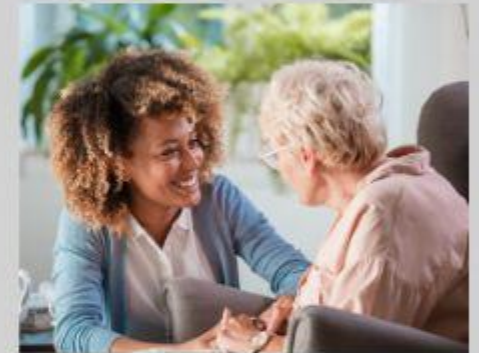
Deliver Bulletins to Shut-ins