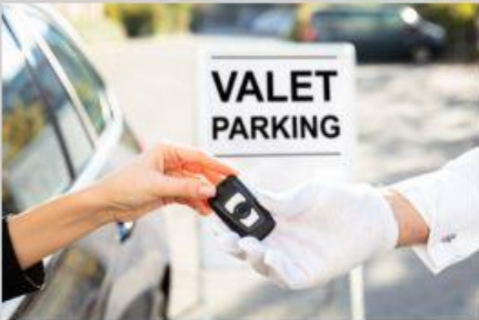
Valet Parking Attendant